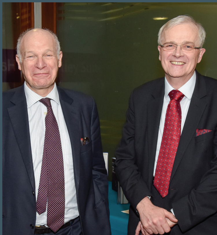
President of the Supreme Court Lord Neuberger visits Southampton Law School.